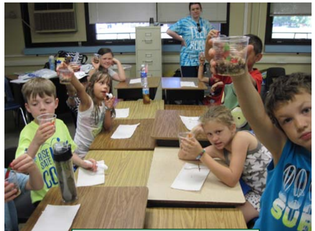
This edible soil is pretty good stuff!