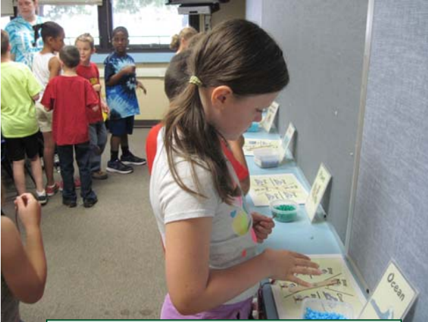
This water molecule has landed in the ocean.